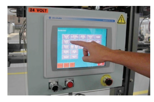
When changing bag sizes, the operator only has to push a button instead of manually adjusting the bag trays.

The compact system and ease of installation are benefits for factory assembly, and these features also will make it much easier to update bagging systems that are already in the field. "Not only will this new design be available on all new Thiele bagging systems, but we already have plans to update dozens of existing bagging systems," says Gifford. "We will continue to offer the system with manual bag tray adjusters for packagers who don't have problems with variations in bag dimensions, but this new design will offer boosts in both productivity and accuracy for any packager."